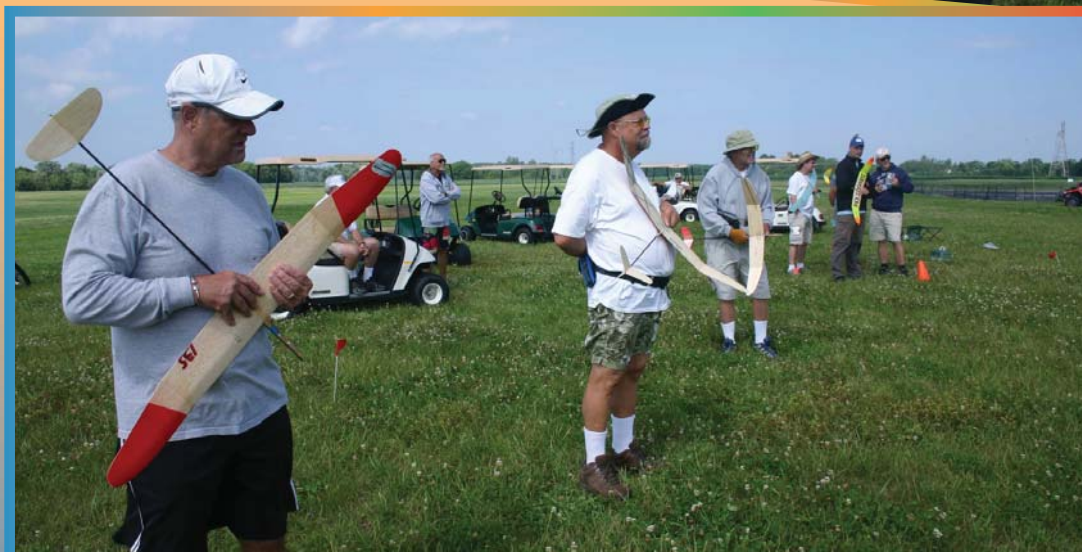
The line at the Glider Pen.