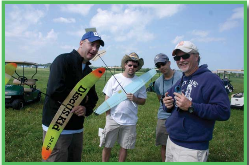
A group of Hand-Launched Glider fliers talk between flights.