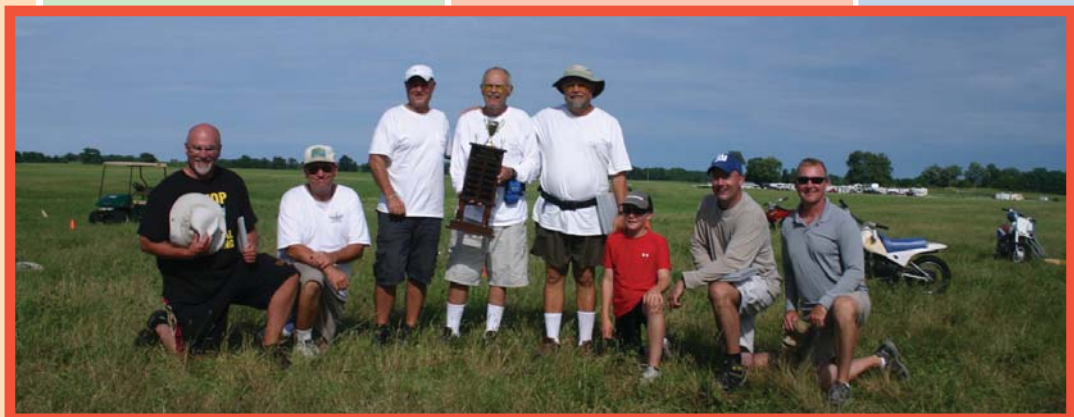
The top three teams in Team Catapult.