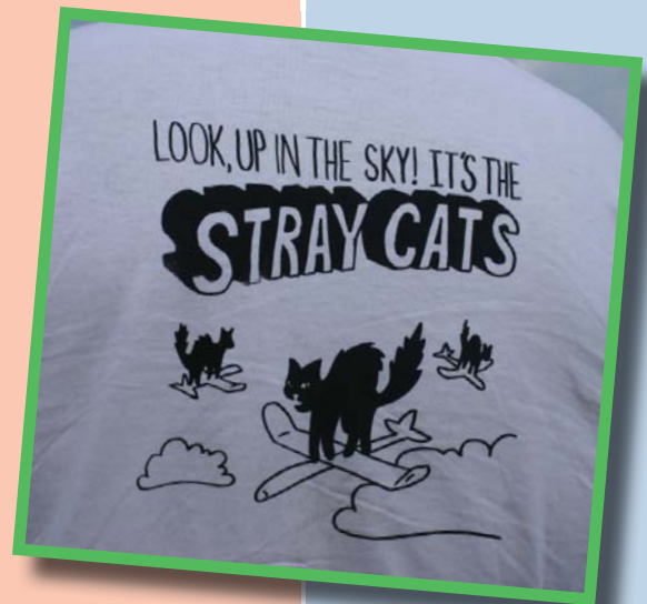
The team logo for the winning Catapult Glider team.