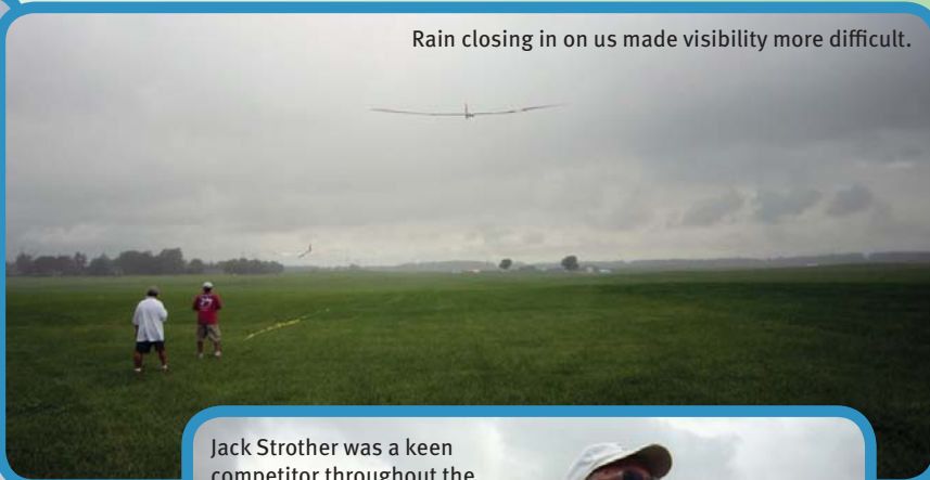
Rain closing in on us made visibility more difficult.